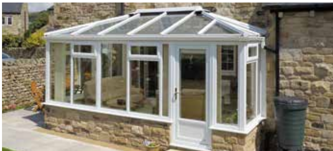
SMARTGLASS® - Proven Performance