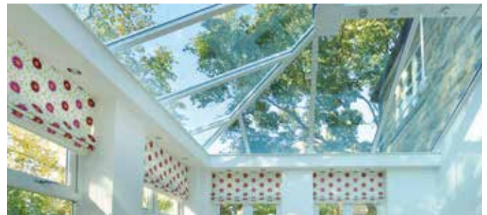
SMARTGLASS® Plus+ - Enhanced Performance